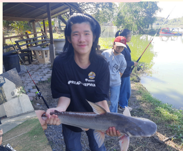
Pulling in the big ones